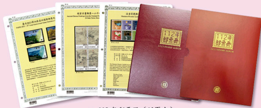
● 112 年郵票冊（活頁本）