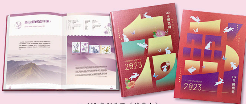
● 112 年郵票冊（精裝本）