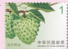
常 142.1 16,000,000

為應業務需要，添印105年1月28日發行之「水果郵票（續）」面值1元，及111年1月12日發行之「故宮玉器郵票（續3）」，面值20元。顧客如有需要，請向全國各地郵局洽購。