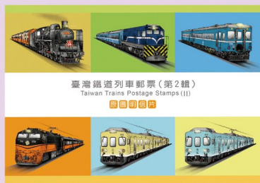
臺灣鐵道列車郵票 (第2輯) Taiwan Trains Postage Stamps (II)