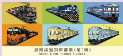
臺灣鐵道列車郵票 (第2輯) Taiwan Trains Postage Stamps (II)