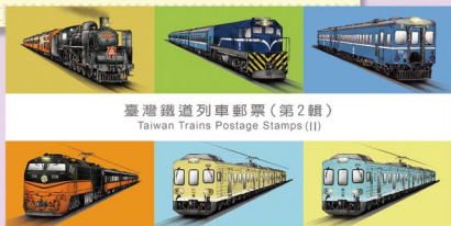
臺灣鐵道列車郵票 (第2輯) Taiwan Trains Postage Stamps (II)