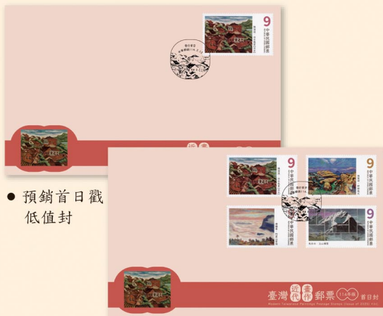
● 預銷首日戳 低值封