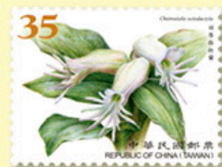
常 146.1 8,000,000

為應業務需要，添印 106 年 11 月 16 日發行之「臺灣野生蘭花郵票」面值 35 元。