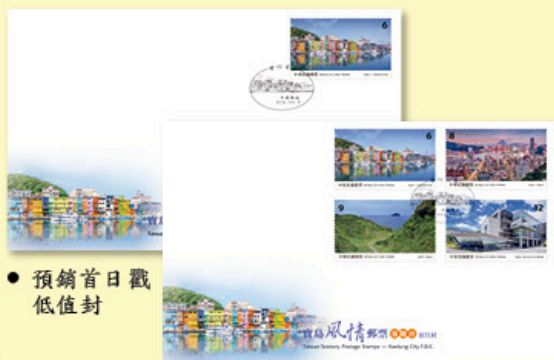
● 預銷首日戳 低值封