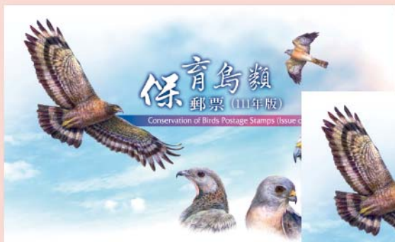
• 貼 (護) 票卡