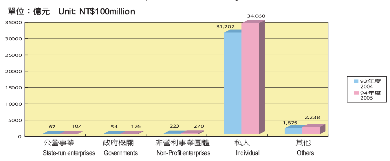
94 年度與93 年度存款業務結構比較表 Comparative Chart of Savings Business