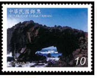
Bridges of Taiwan Postage Stamps (III)