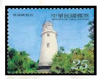
Modern Taiwanese Paintings Postage Stamps (Issue of 2010)