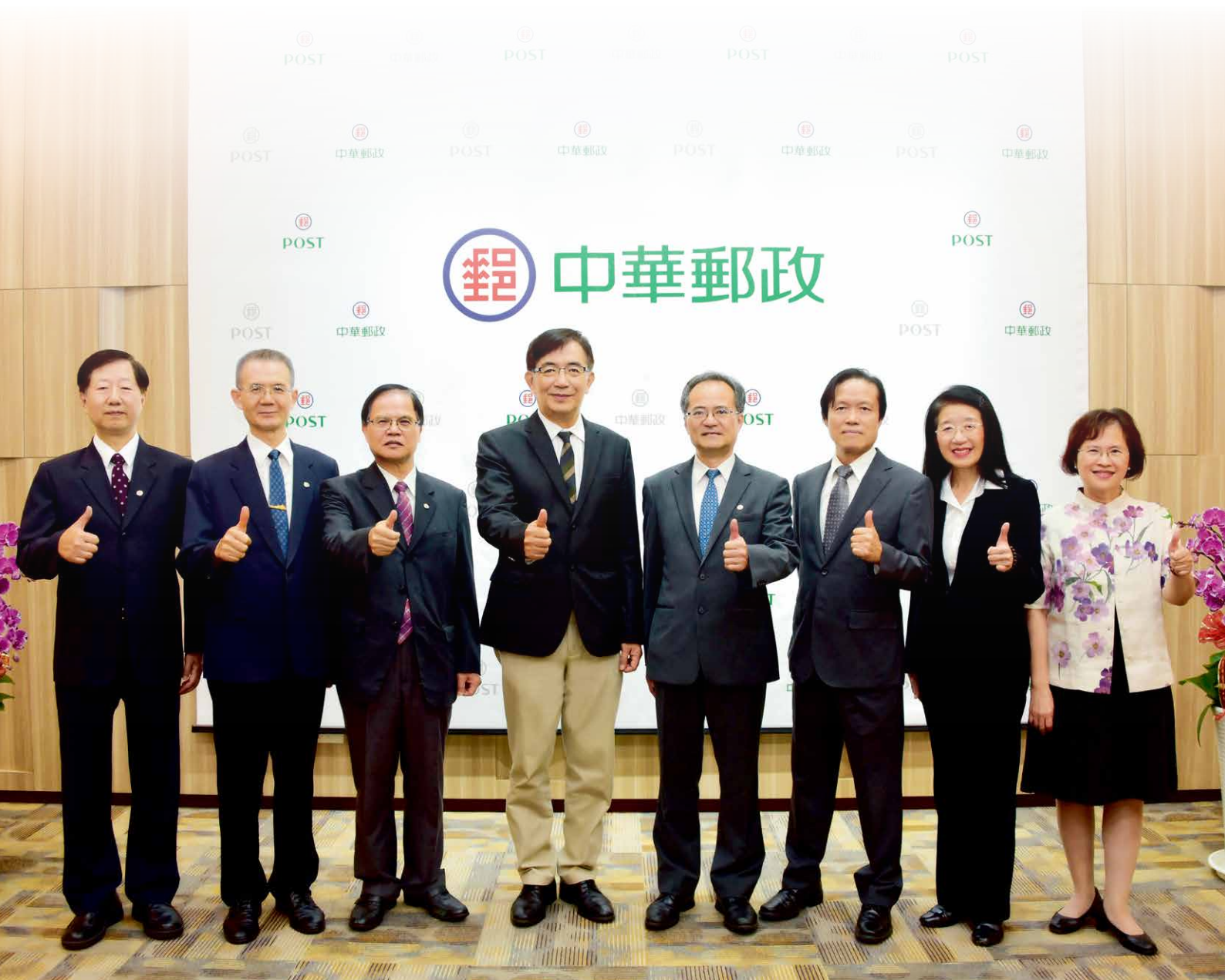
Management Team (From left to right)

20 II. Information about Board of Directors and Supervisors, President, Vice Presidents, Department Heads and Managers of Various Branches